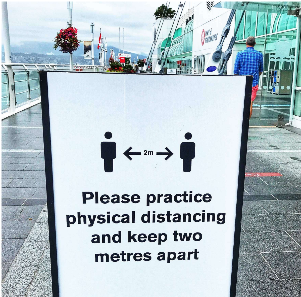
Canada Place, Vancouver (above) South Dyke Trail, Steveston (below)