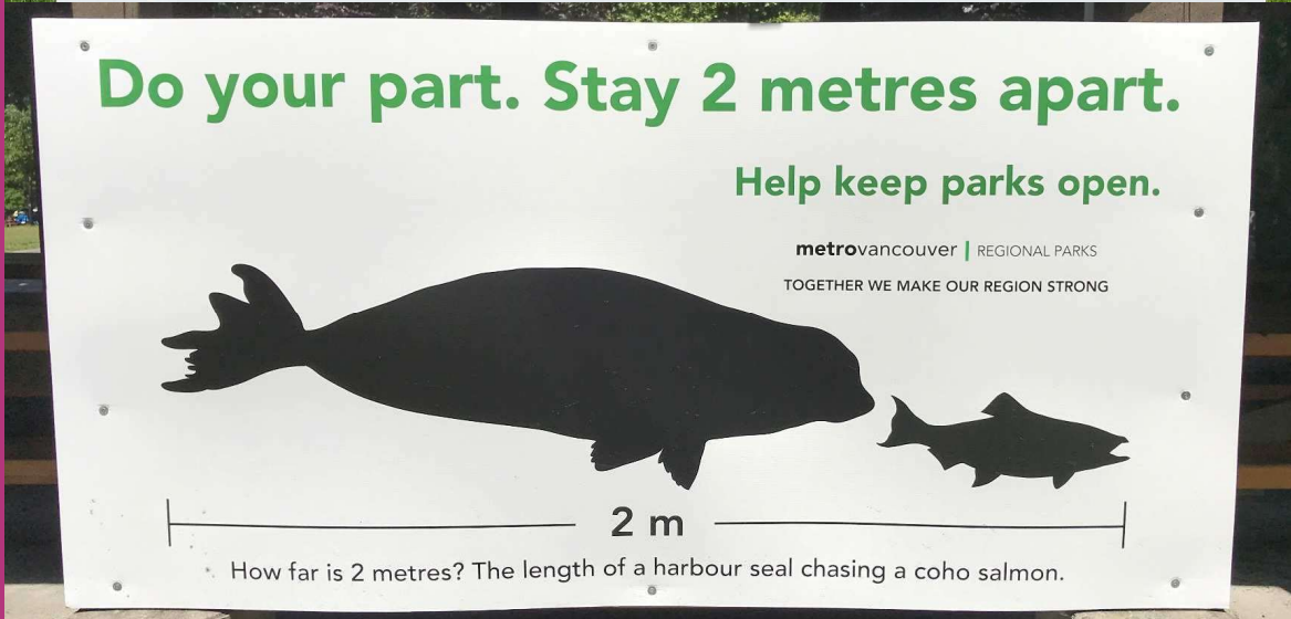
Middle Arm, Richmond; Cedar Mills, North Vancouver; Belcarra Picnic Area (top to bottom)