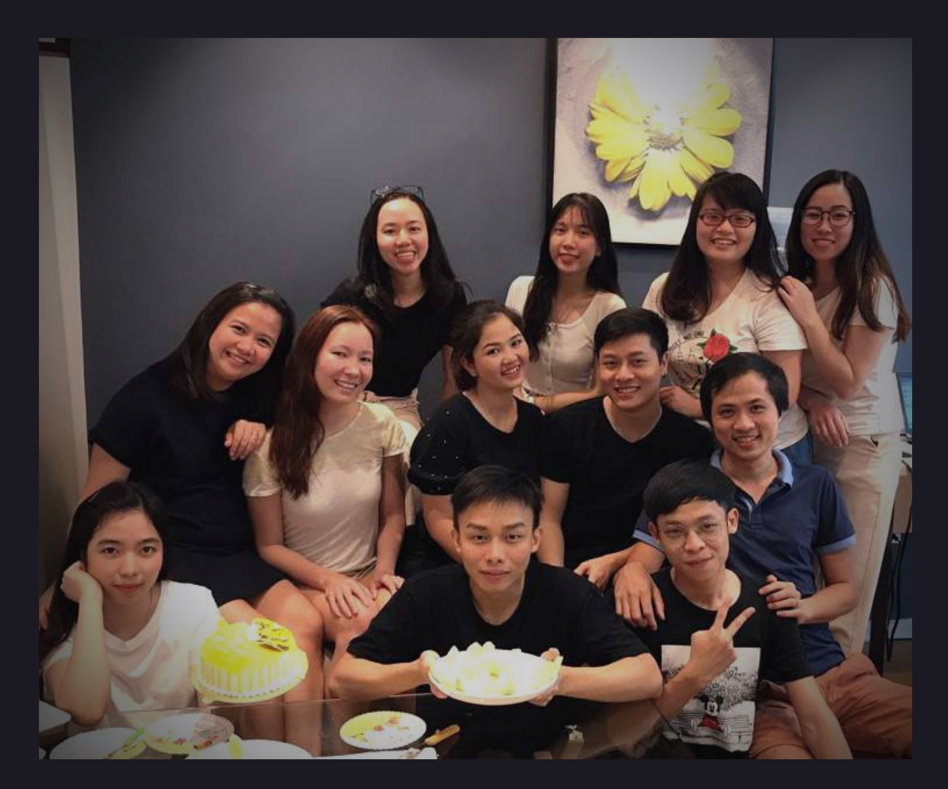
MEET OUR TEAM